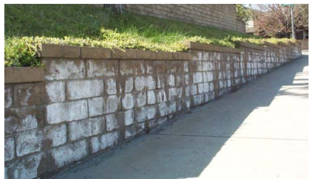
Figure 1. Typical white efflorescent salts on brick and block masonry